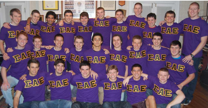
The Fall 2012 Pledge Class