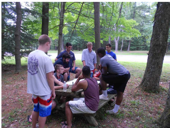
Breakout group at retreat assessing SWOTs of the Chapter to help set goals