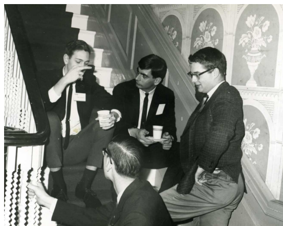
Brothers Conversing during Alumni Weekend 1965

Minerva's Shield and RPI risk management policies require BYOB and no kegs and it is better if you make plans to not stay at the house but at a area hotel.