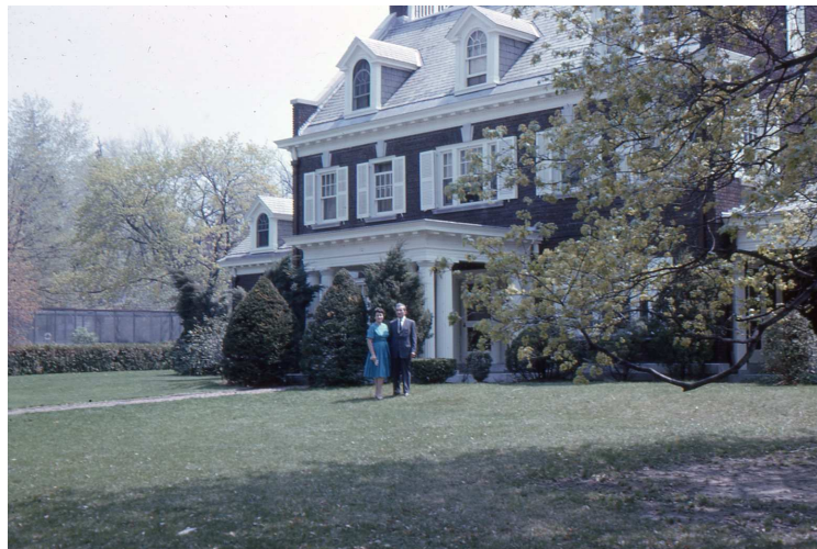
Scenic 12 Myrtle Ave in 1966 - check out the size of the row of bushes on the side!