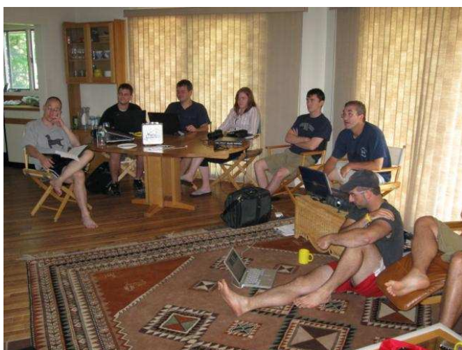
LAE/EC retreat viewing presentations @Wronsky's in Maine.

If anyone is interested in helping with these groups please contact "Jerry" Witter at jonathan.witter@gmail.com .